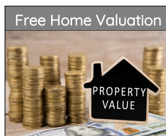
Free Home Valuation